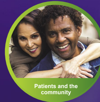
Patients and the community

The goal of this initiative is to optimise the standard of care for hearing impaired adults by addressing the unmet needs of patients, primary care providers, hearing health professionals (HHPs) and policymakers.